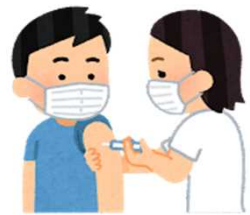
Both those who is returning to Okinawa

Even the person who welcomes visitors should also be vaccinated.