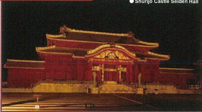
● Shurijo Castle Seiden Hall

This World Heritage symbolizes the Ryukyu Kingdom. It is illuminated from sunset to midnight every day, creating an attractive and mystical atmosphere.