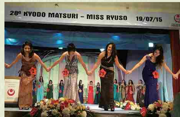
Kyudo Matsuri - Miss Ryuso 2015