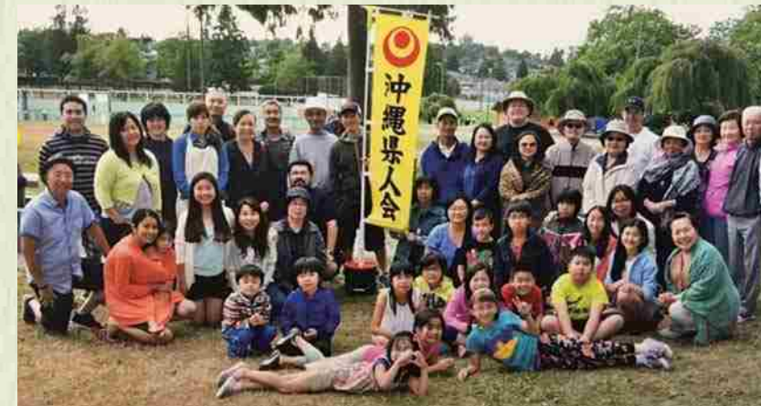
Our summer picnic provides a great chance for everyone to catch up.

Active since 1975, an "at-home" atmosphere guides our exchange efforts.