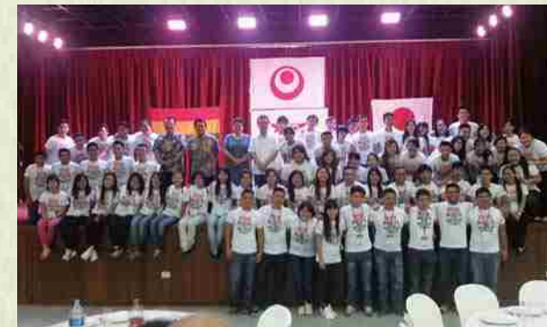
Niseta Tour participants, commemorative picture.

With over 1,500 members, We are a top class Kenjinkai Network.