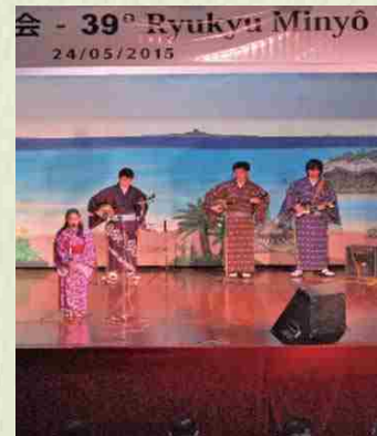
Ryukyu Minyo Festival