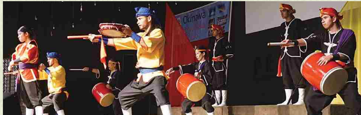
A joint performance between the members of Texas Ryukyu Matsuri Taiko and our Tomonokai at the 20th anniversary celebration.

In March of 2015, we celebrated our 20th anniversary! We work hard to pass down Okinawan culture to the next generation.