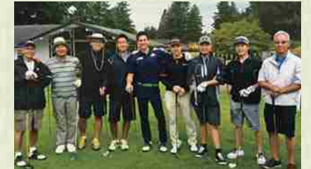
An informal golf gathering.