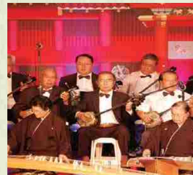
Performance by the Nomura-Ryu Music Association's Brazilian branch.