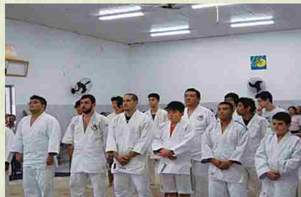
Okinawazumo (Okinawan sumo) 2015