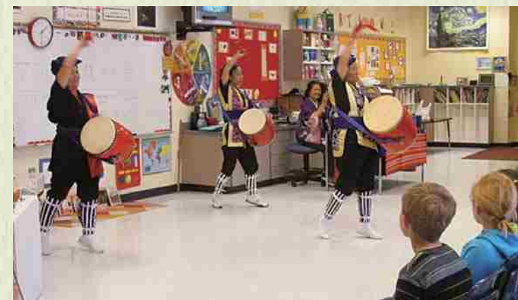
January 2014 – We had a booth and a Ryukyu Buyo performance at the Japan association. The local kids were fascinated.

We often visit elementary schools and introduce children to Okinawa and Japan.