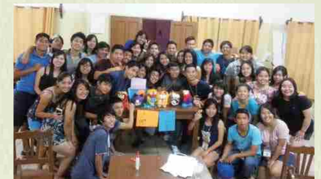
Learning about traditional Okinawan crafts by splitting into groups and making guardian shisa.