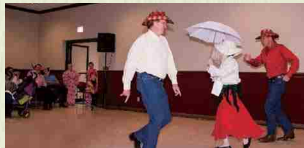
2015 New Year's Party – This Texas-Style Modorikago dance had the audience in tears of laughter.