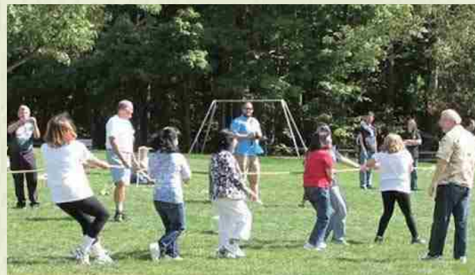
Summer Picnic Members got together to share food, drink, and catch up. There were also Eisa performances from the adults, and the kids took part in Eisa and a tug-of-war competition.