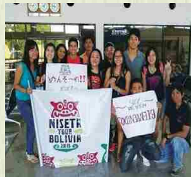
Participating in the Niseta Tour 2015 in Bolivia (To be held in Brazil in 2016)