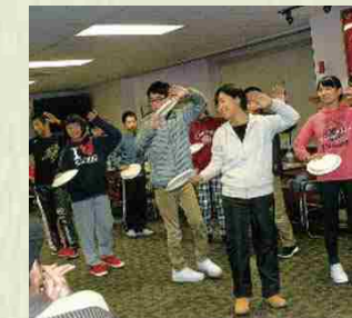
October 2015 – A welcome dinner for exchange students to Canada from the town of Haebaru.