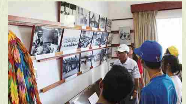
Learning about immigration: First generation immigrants teaching later generations about their connection to Okinawa at the Okinawa First Wave Immigration History Museum.