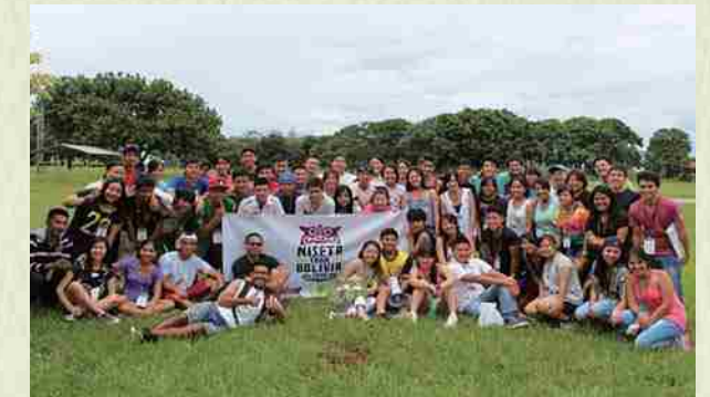
At Colonia Okinawa, an immigrant destination.