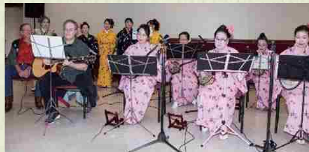
2015 New Year's Party – This year, we were honored to have a number of high school exchange students on vocals during our performance. The sanshin performance is a big hit every year.