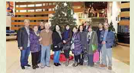
General meeting on the eve of Christmas.