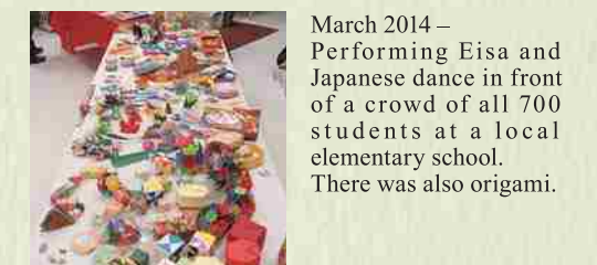
March 2014 – Performing Eisa and Japanese dance in front of a crowd of all 700 students at a local elementary school. There was also origami.