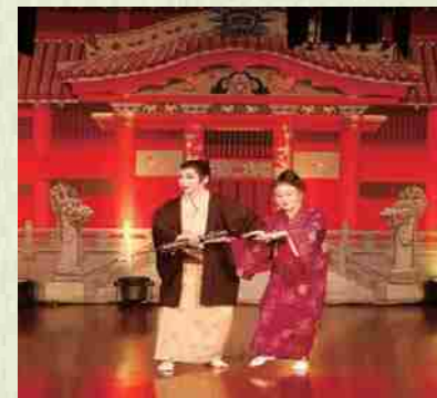
Okinawa Shikai 2015