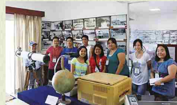
The Okinawa First Wave Immigration History Museum, commemorative picture.