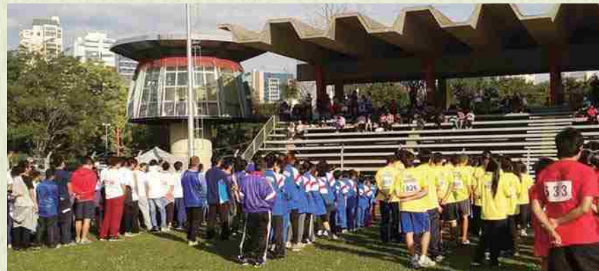
Kenjinkai-organized track-and-field festival.

With over 2,000 members, we work to pass down Okinawa's culture far and wide. http://okinawa-brasil.blogspot.jp/