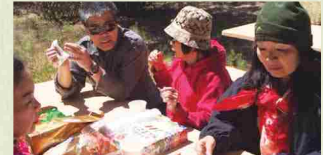
2015 Picnic: Deepening friendships and building harmonious relationships through BBQ and more.