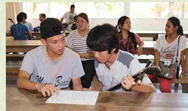
Traditional Okinawan Performing Arts Study: Deepening exchange through the sanshin.