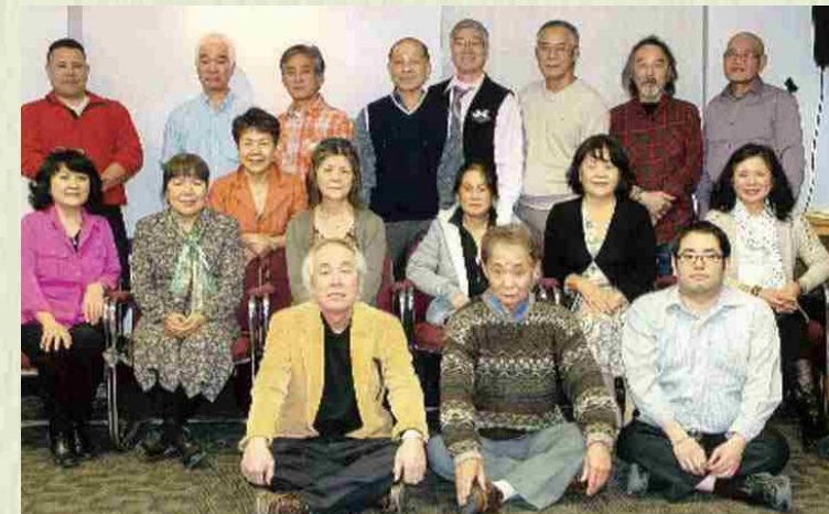
January 2015 – New Year's Party

Founded in 1982, we have 57 registered members across 20 households.