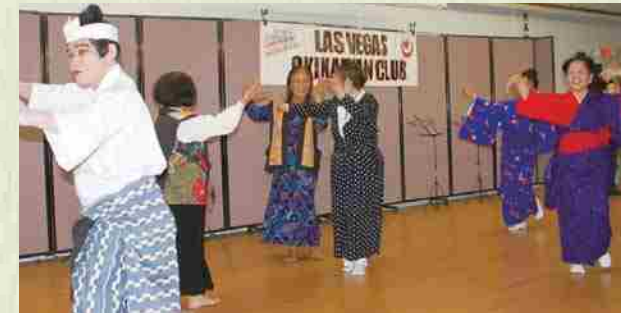
The finale of our 2014 New Year's celebration.

Our yearly events include a spring picnic and a New Year's party in the winter. We also have sanshin and Ryukyu Buyo groups who periodically get together to practice. We showcase the results of these practices through shared events with other Nikkei groups, and conduct exchange with Kenjinkai in neighboring states and the local community.