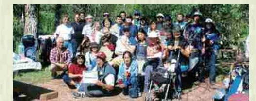
August 2015 – A picnic at Fish Creek Park