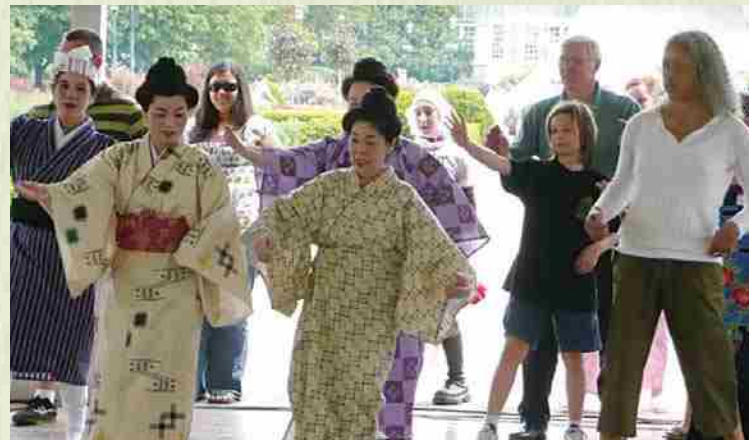
Asia Festival A festival where over 20 different Asian countries come together. The Tomonokai had its own booth where guests were treated to sata andagi and more. We also performed traditional Okinawan dances such as Ryukyu Buyo and Eisa.